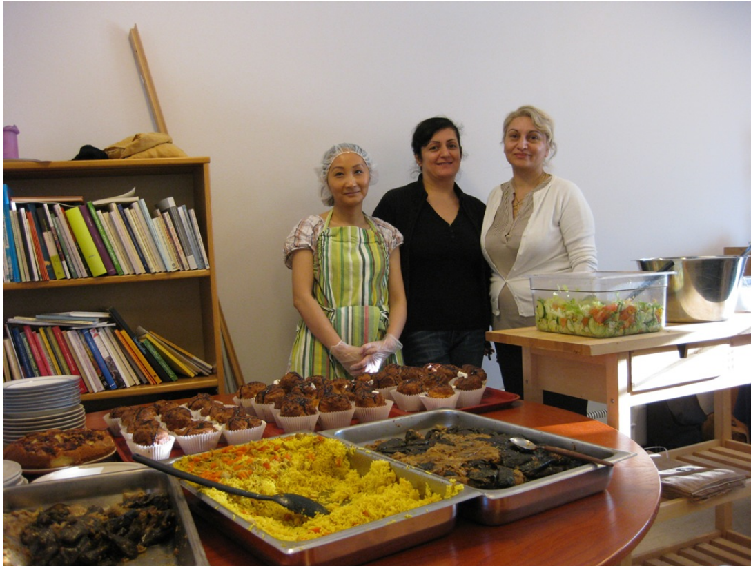
Figure 7. The pilot project carried out a workshop lead by a South African architect where ten women involved in a catering course as a labour market arrangement took part.