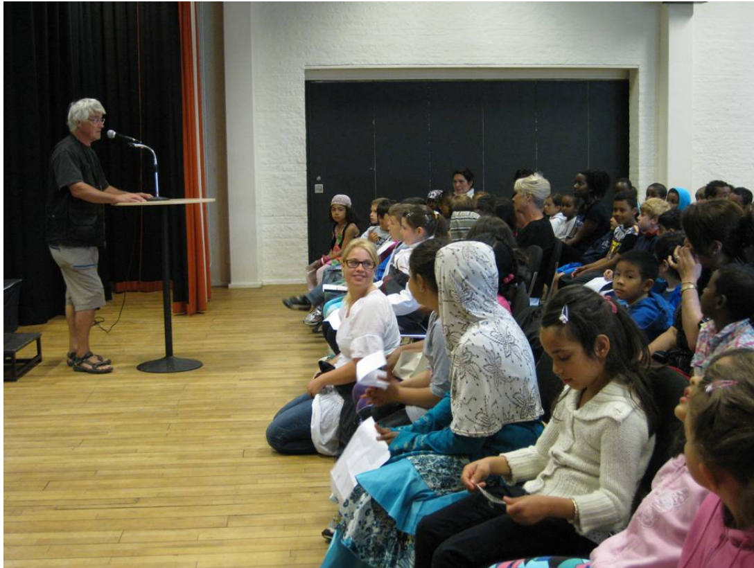
Figure 6. The children raised many questions to the employees from the housing company, they really wanted to understand the reasons for stopping the project.

Here we take a break from the case description and turn to the 1 st of the four questions we are going to answer in the pilot project: What are the characteristics of the 'cultures of participation and learning' in which inhabitants participate? This question may perhaps be understood as describing cultures of participation and learning as something normatively 'good' but our interest has not really been to position ourselves in that way. As is hopefully obvious above, participation and learning can be considered both as positive and negative at the same time, depending on what perspective you have. However, we still of course want to search for the answer of that question. When discussing our analysis of all our different activities, we came with this answer of that question: