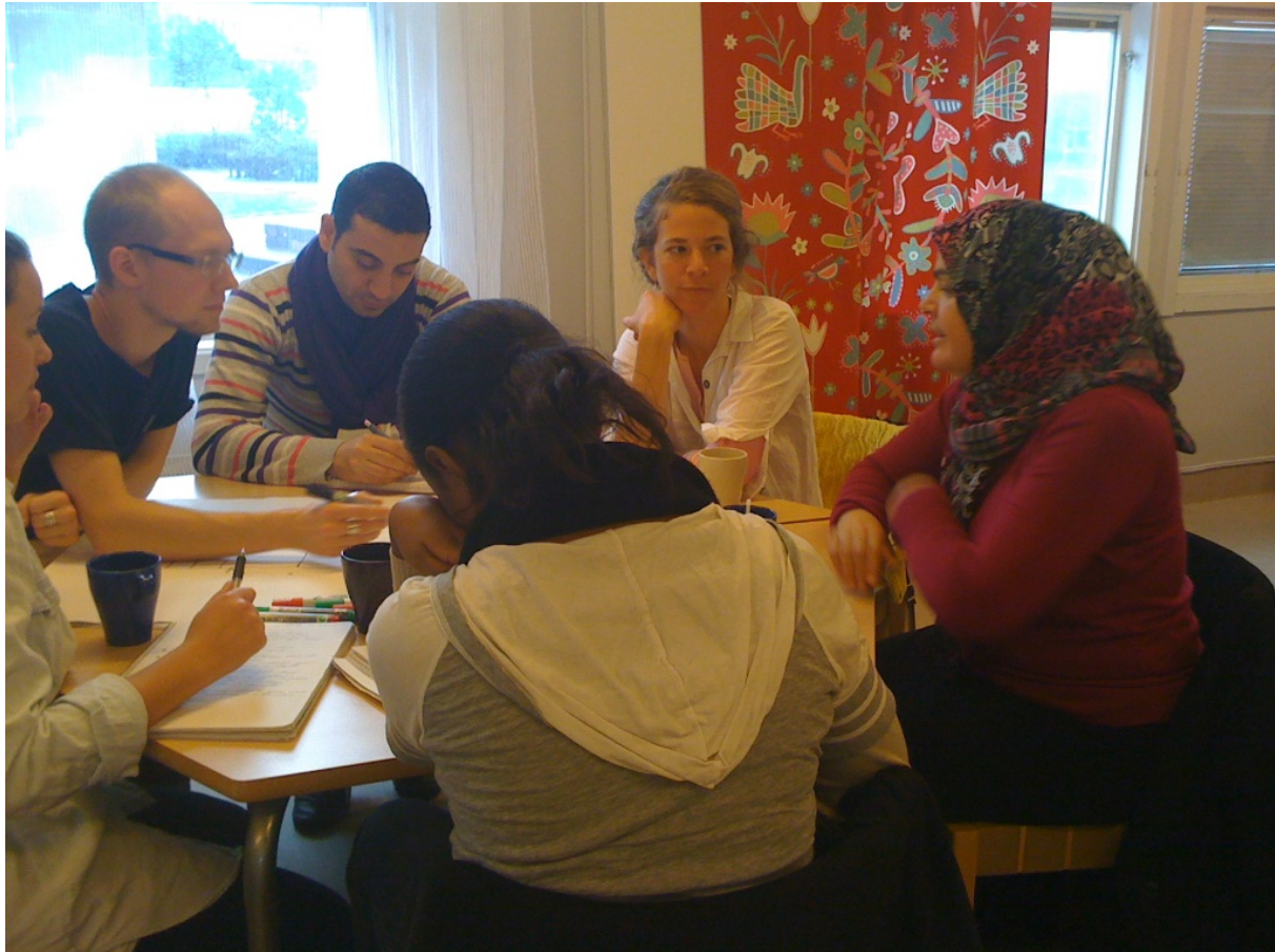
Figure 8. The students acted as assistants in codesigning; the teacher and social work students in each group took the role of translators and the architect students of shapers – of the ideas of the ten women.

aspects. The Meetingplace people – by taking a step back – contributed in a most sensitive way to this shift in focus for the workshop. The final result of the workshop was five built models of how the actual building at the square could be refurbished in order to fit for a café and a meetingplace (see figure 10).