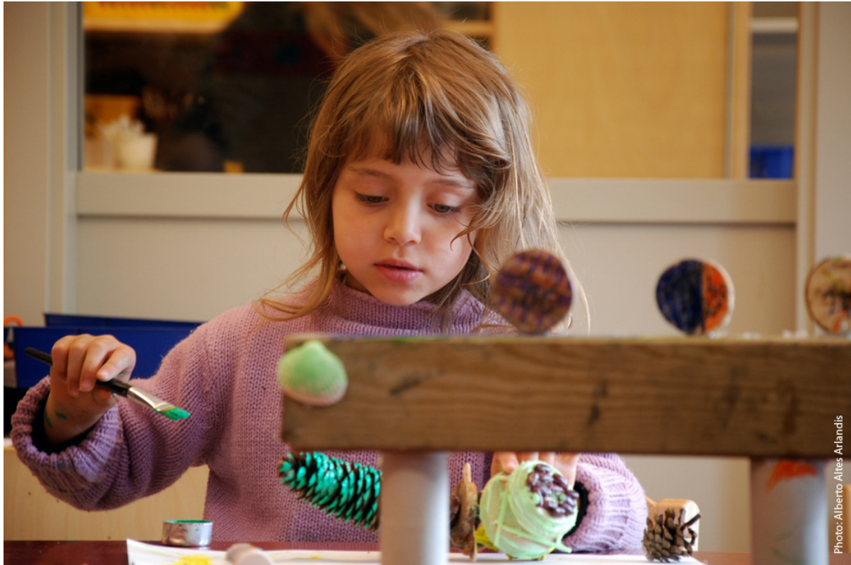
Figure 2. Children from Emma school were involved in the process.

This part of the work we carried out together with our colleagues in another pilot project presented in this book, Urban Games , which was a group knowledgeable in didactic tools for communication. They wanted to test some of their tools, and we wanted to learn how the kind of tools they developed could be used as part of urban empowerment processes including citizens. We learnt several things from these workshops. One lesson was about the choice of tool for different age groups, where we easily could conclude that construction of board games was a great tool for communication on urban planning with children in the ages of 6-9, very well adapted to their impulsive creative capacity (see figure 3). At the ages of 10-12, on the other hand, electronic games would have been preferred, as these children seemed much more cautious to freely express their creativity and therefore needed something that would really catch their attention – e.g. computer-like games. Another lesson was about outcome, as it in our pilot project on urban empowerment was considered that the games were tools not only for creativity in itself, but also to be part of an urban planning process. Here, again, the smaller children stood out as very creative in a special way, which we believe had to do with two things that will be discussed below.