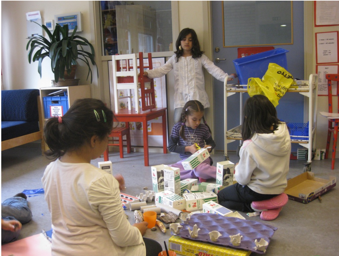
Figure 3. Construction of board games was an attractive way of working for children in the ages of 10-12.

One reason was mentioned above: if the tool had been electronic for the elderly it would perhaps have captured their attention better and freed their creativity more. Now they did not really succeed in using the game as a tool for urban planning. The other reason has to do with external causes in combination with the skills of the teachers – thus their personal capability of transforming problems into triggers for learning. The external cause was a phone call from the public housing company the day before the workshops were going to start: they told that the event park in Hammarkullen was not going to be built, because they were just told that a new European Union adapted law, three months old, forbid all Swedish public housing company to make investments that are not businesslike. Thus, they could only motivate refurbishing the park, if it really would show that it could increase the rents. And rising rents in housing areas like Hammarkullen, where many of the poor people in Sweden live, was not in question at all. Moreover, the current land was actually not even owned by the housing company, but by the park and nature administration of the city.