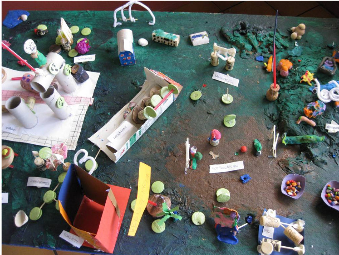
Figure 4. The urban games workshop was turned into a proposed design layout for the park.

material for their board game. When the teacher told the kids the sad news from the housing company, she also said: 'but we will do the park anyway, won't we?' This was approved. So they built the model during that day, formed as a board game, a fantastic creation and to a great extent also feasible (see figure 4).