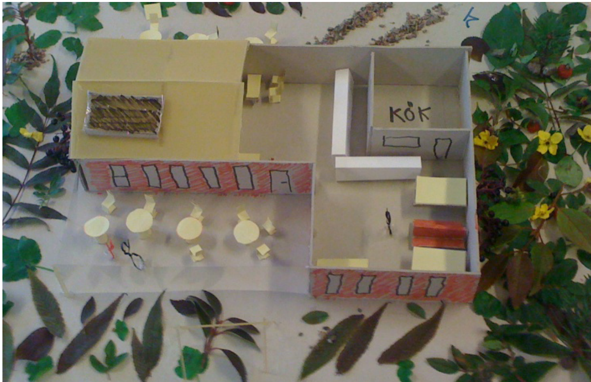
Figure 10. The final result of the workshop was five built models of how the actual building at the square could be refurbished in order to fit for a café and a meetingplace

experience, this is partly related to organizational learning (Argyris & Schön 1995), thus to how organizations learn from the employees, and vice versa. The social worker in charge is not part of an organization that has learnt. It has, as an organization, not found a way forward that falls within the boundaries of the competition law. The social worker, however, had quite a lot of 'negative capability' and found another way forward: the women will now start a cooperative café in the premises of a learning centre in the city centre instead. This solution is of course very satisfactory for the women, but unfortunately the suburban residents and employees lose the chance to eat the wonderful food they produce.