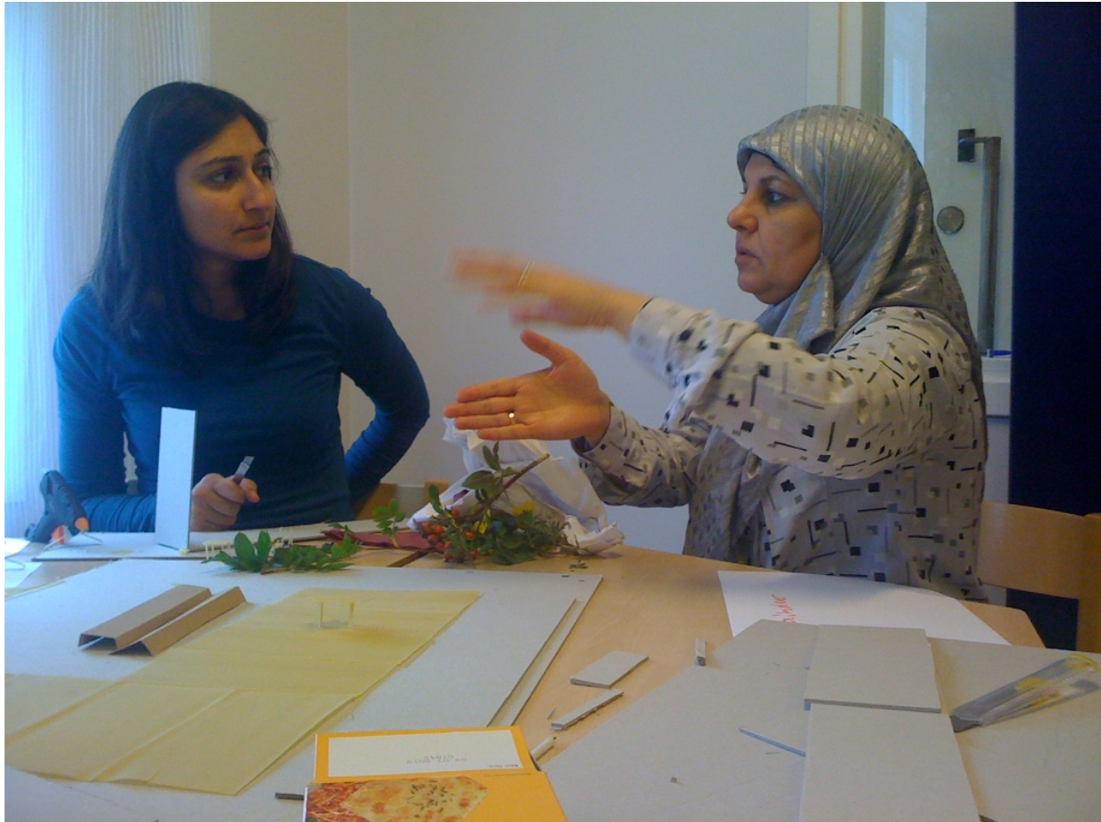
Figure 9. Architects and inhabitants obviously do not always speak the same language when trying to communicate on the physical environment.

Many of the Café women are still involved in the Meetingplace but their café idea did not go as expected. When inhabitants become co-actors in urban governance and development, they also become producers rather than mere consumers of the urban fabric. Empowerment thus releases and redirects energy, and to a certain extent it can also be considered a source of new energy. What the actions of the social worker that supported the women gave to the them, was time to learn some skills they lacked. Thus, he made it possible for them, while on welfare, to get training in catering, business economy and health issues. Additionally, this training was organized so as to empower them as a team, which was why he had decided to take part in the workshop with the design students in the first place. In this way, he also enabled the social work and teaching students to be part of the learning process – which was very much in line with the learning objectives for their courses.