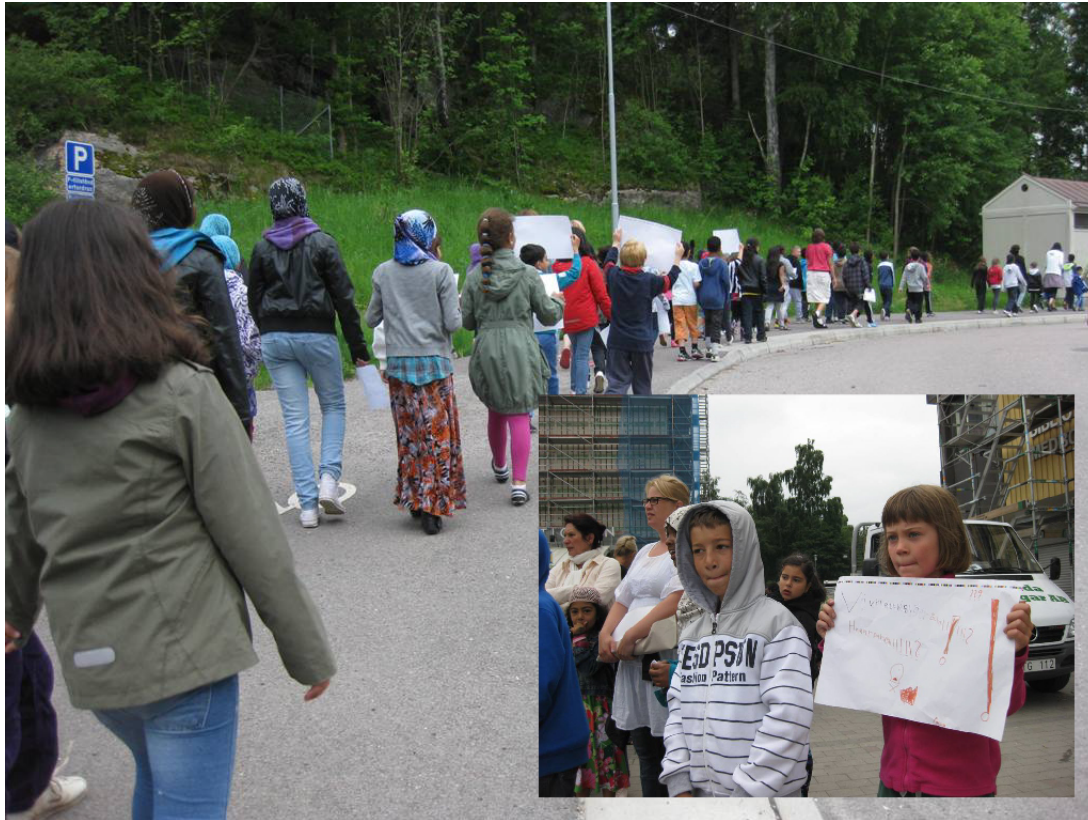
Figure 5. The children marched all the way from the school to the Peoples hall where the model of Hammarpark was handed over to the housing company.

This is not a sunshine story. We would never belittle the deep disappointment most pupils and teachers felt when the negative news about Hammarpark showed up the same day the workshop started. Of course, it would have been much better if the reconstruction of the park within a couple of months would have been out on procurement and built before next summer, which was the plan. Instead of being there unattended, like a barrier between the square and the homes. However, the pilot project need to learn from negative experiences as well, and they have actually often been more telling than our positive experiences. We have after this experiences been occupied with the question of how the involved teachers – as part of their ordinary professional work – could turn their disappointment into a learning experience. What was it they had, as individuals and as an organisation, that gave them the capability of handling uncertain and rapidly changing processes such as this?