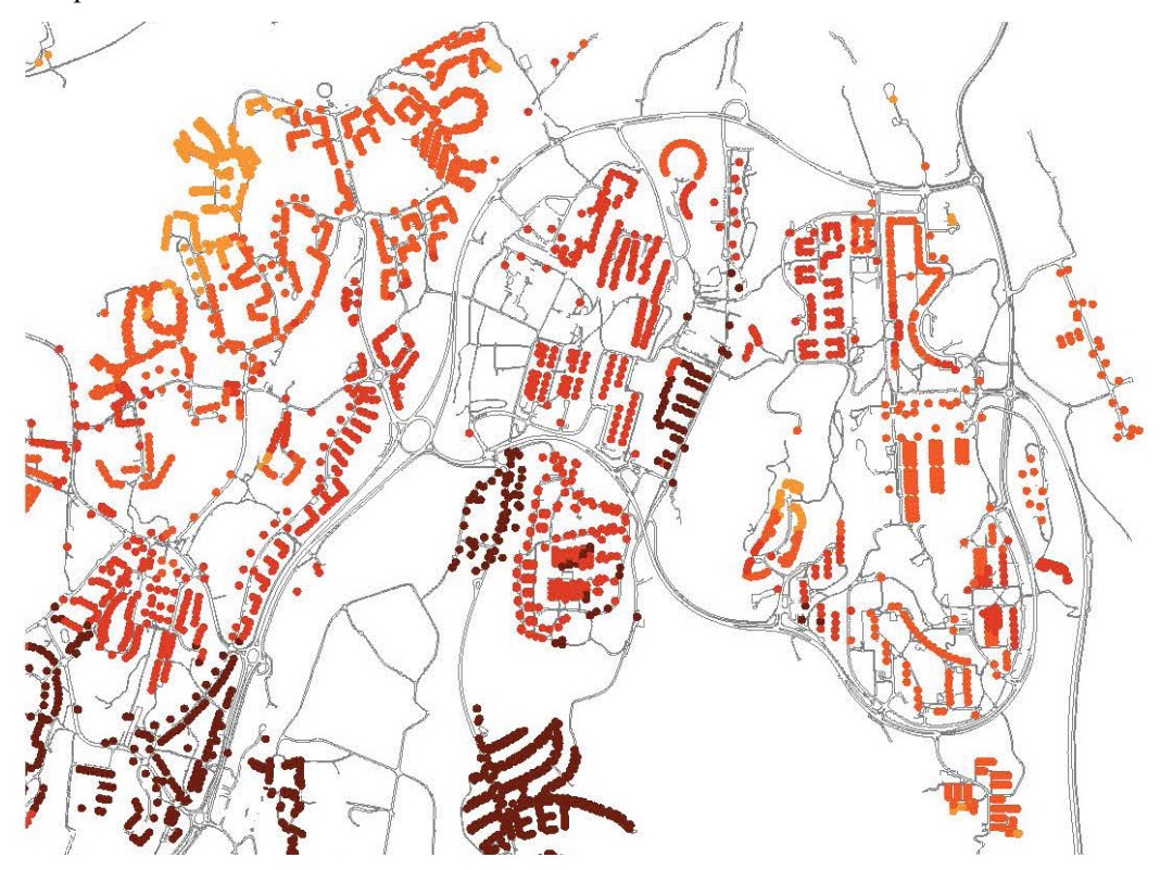
Figure 3. Thematic map illustrating access to workplaces.

To change this unequal distribution, one can either add workplaces locally or make existent workplaces elsewhere more accessible.