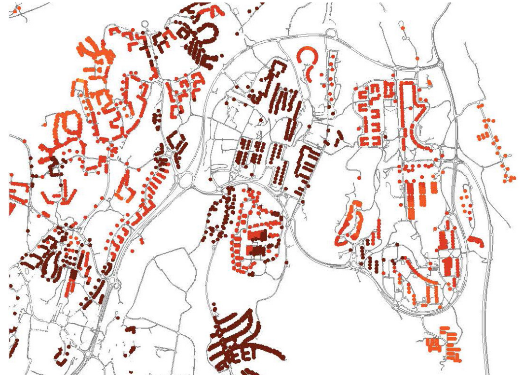
Figure\ 5. The matic\ map\ illustrating\ access\ to\ workplaces\ according\ to\ proposed\ interventions.

This would result in a stronger public axis connecting both sides of Bergsjön, and that, in turn, would provide better access to workplaces in the western part of Bergsjön (figure 5).