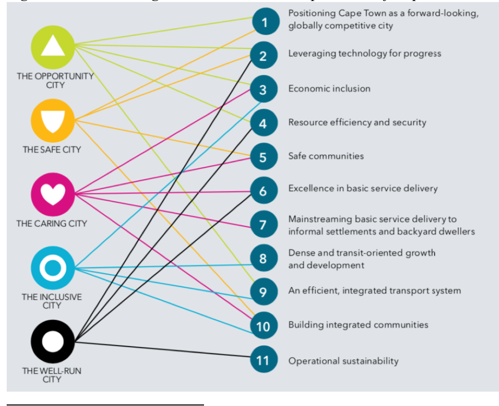
Figure 4. The 5 Strategic Focus Areas and 11 priorities of Cape Town's IDP

The IDP consists of five pillars or Strategic Focus Areas, which are connected to 11 priorities which transform into 11 objectives that are in turn operationalised to the programme and project level (see Figure 4).