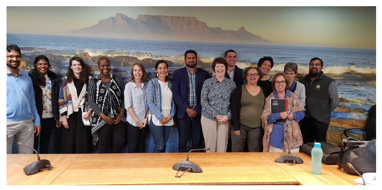
Knowledge exchange event City of Cape Town-eThekwini municipality 17 April 2019

In addition, the embedded researcher conducted interviews and facilitated meetings with relevant actors at national, provincial and city level and participated in a series of events across the country related to the SDGs and NUA, including: the National Urban Conference in Johannesburg in October 2018, the Cape Town Partnering Think Tank for Urban Sustainability in Cape Town in March 2019, the SDG symposium in Durban in July 2019 and the UCLG World Summit in Durban in November 2019.