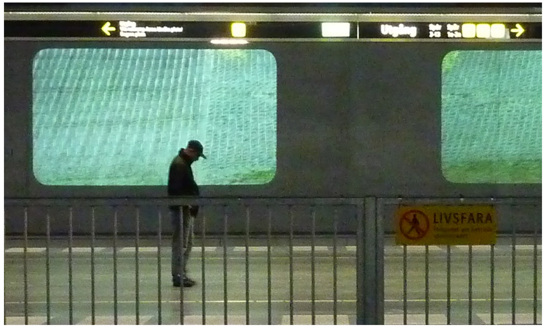
Tania Ruiz Gutierrez, Annorstädes / Elsewhere / Ailleurs , permanent video installation for the City Tunnel, Malmö Central station, 2010. ©Tania Ruiz Gutierrez, 2010