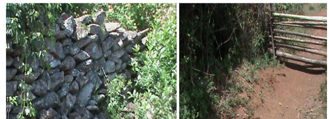
Figure 7. Asembo Stone-Walled Enclosure Site

men, lead in offering sacrifices to appease the gods and avert calamities and misfortunes such as drought and famine facing the local inhabitants. The enclosures are places of past human habitation where people lived a communal form of lifestyle for labour mobilization and security reasons. Initial attempts have been made to form a Community-Based Organisation where women and young people are part of the governance committee. The cultural events are informative learning grounds for most of the management members of Seme-Kaila to engage in eco-ventures such as traditional dressing, basketry, pot-making, traditional dances and songs, drama, performing art, and sports.