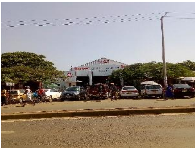
Figure 3. Jubilee Market in Kisumu city

They include Aguch Kisumu, Oile Park, Jubilee Markets, Social Halls, Kisumu Museum. Places such as Aguch Kisumu, Oile Park, Jubilee Markets, Social Halls and Kisumu Museum represent varied values to urban users ranging from livelihood spots like market places to green urban spaces which reduce and control environmental pollution as well as provide recreational functions for unemployed urban dwellers, and social gatherings such as table-banking women's groups. Initial mapping reveals the value of everyday social and recreational spaces which reveal values associated with cultural heritage and nourish the lives of residents and visitors, including Aguch Kisumu and the cultural infrastructure of the city – found in the cinema, disco, hotels, markets, clubs and restaurants.