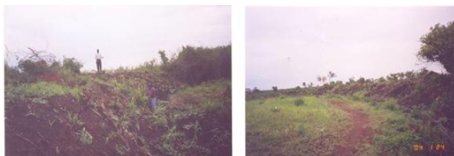
Figure 8. Gunda Buche: Architectural Features C. Cultural and Sacred Sites

Majority of these structures are not partitioned but a few structures have interior partitions or external extensions such as Oiko structures in Sakwa region, Bondo Sub County. The structures were constructed through piling up of the earth material dug from adjacent ditches. The dating and origin of Gunda Buche is still uncertain. Test excavations have not been carried out within these enclosures. Moreover, oral history provides conflicting information regarding their origin and date. The present inhabitants around these structures suggest they were built by non – luos. A historical gap surrounds these structures. The history of the locals is not connected to the origin of the earthworks. However, another version ties Gunda – Buche with the ancestors of the local inhabitants. The earthworks are currently under serious threat from human activities such as cultivation, quarrying, construction and re – use of the archaeological materials in the homesteads of the local people. The community members around these structures should be made aware of their cultural importance. These earthworks should be gazzetted and protected by the National Museums of Kenya.