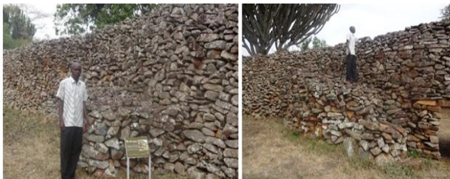
Figure 6. Thimlich Ohinga Site in Migori