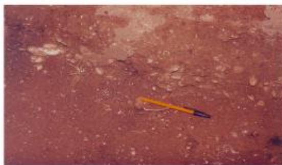
Figure 5. An Archeological Site in Ulowa