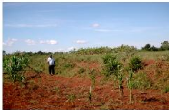
Figure 4. Gunda Pudha in the outskirts of Bondo Township

The region surrounding Got Ramogi and beyond is a melting pot of rich and varied archaeological site depicting the lives and migration patterns of the Nilotes, dating to thousands of years back. One such site is exemplified in the area of Ulowa, at the foot of Got Ramogi. In addition to Ulowa, there are several naturally sheltered settlements having shrines in the region of Got Ramogi and beyond, for example, Gunda Pudha (Fig. 4 and 5) and Bur Gangu which is famous for iron artefacts. These sites provide excellent opportunities for archaeological tourism.