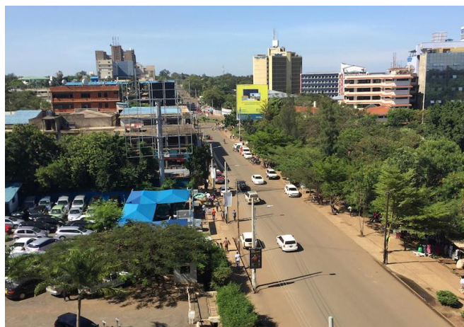
Figure 1. Change of Use Due to Human Activities

unique lacustrine region of western Kenya. Unfortunately, the majority of these sites, artefacts and features are under serious threat (Figure 1) from both cultural and natural processes. The most serious problem is the grabbing of gazetted sites. An urgent conditional survey and documentation should be undertaken to assess their condition and facilitate their conservation, preservation and restoration for sustainable use by the local communities living around them. Even though some of these sites are gazetted and managed or protected by the National Museums of Kenya, there is very little community involvement in their management and use.