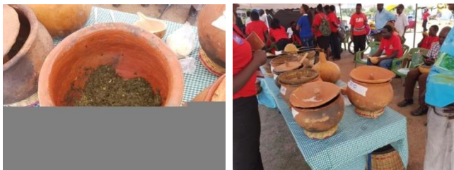
Figure 10. Traditional Luo Festivals

I. Events, and Festivals: Traditional events and festivals i.e. Tero-Buru, Traditional dances, Annual festivals ie Dunga Fish Night, Got Ramogi, Migwena, Suba