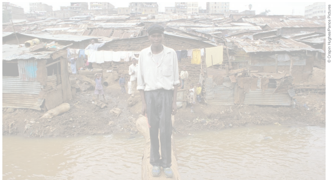
Village One, Mathare Valley, a slum in Nairobi.